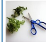
Cut or snip