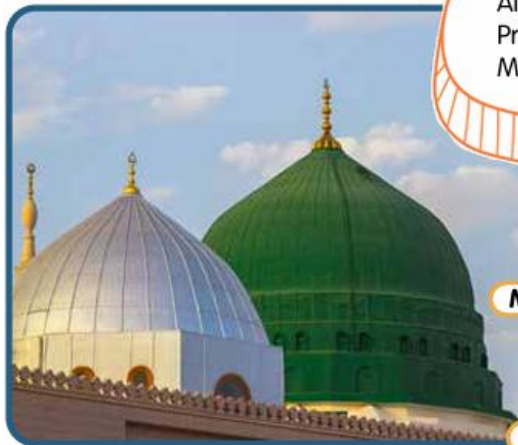
Al-Masjid al-Nabawi (The Prophet's Mosque'), in Medina

Medina tun Nabi means 'the city of the Prophet'