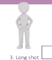
3. Long shot