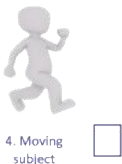
4. Moving subject