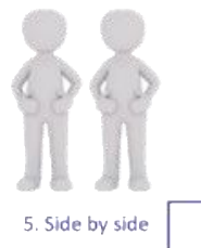
5. Side by side