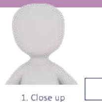
1. Close up