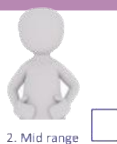
2. Mid range